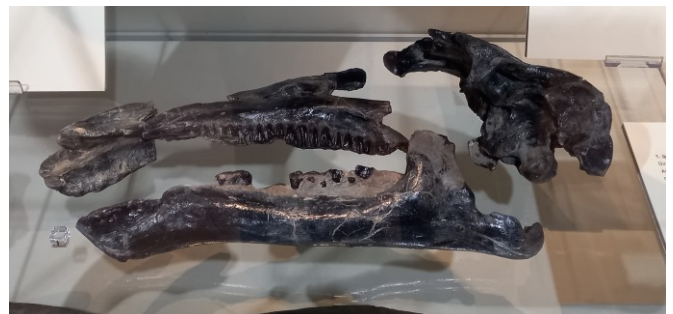
Image: Iguanodon jawbone on display in The Age of Dinosaurs special exhibition. The exhibition closes on 30 th April 2023.

Permanent exhibition (downstairs galleries): Lives and Landscapes. The story of West Berkshire told chronologically.