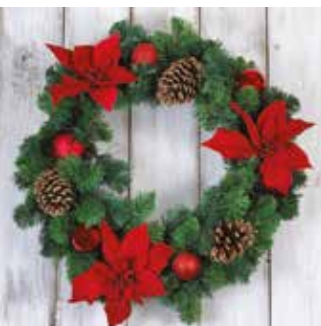
Christmas at Shaw House Events throughout Dec