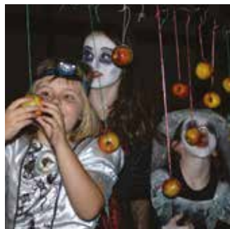
Halloween Party Night Shaw House : Thurs 31 Oct