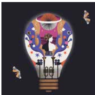
Museums at Night West Berks Museum: Oct 2019